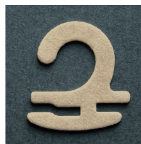
TEF-01N (former of BD-12) w27×h28.5mm

It is a paper with a very strong and gentle texture.